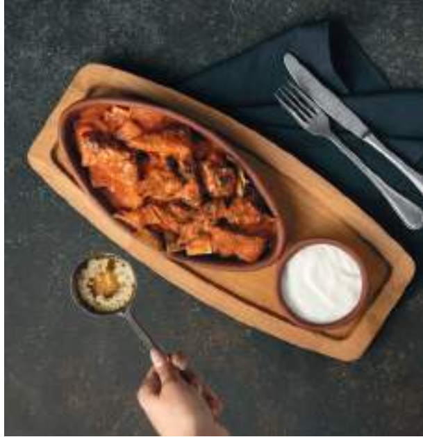
Special Iskender Plate with Meatballs