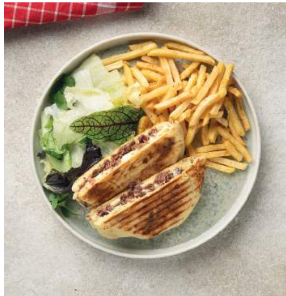
Bazlama Toast with Pastrami