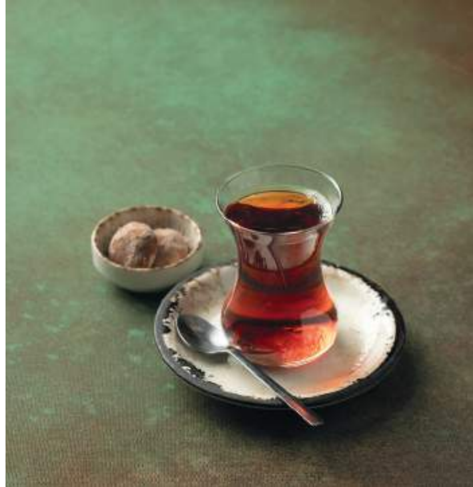
Glass of Tea