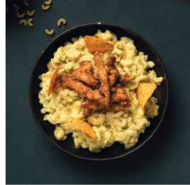
Cajun Chicken Mac And Cheese