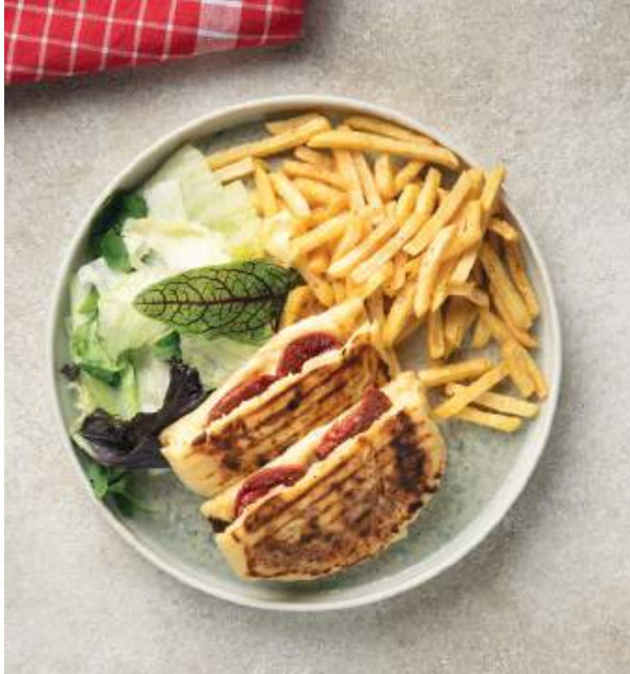
Mixed Bazlama Toast