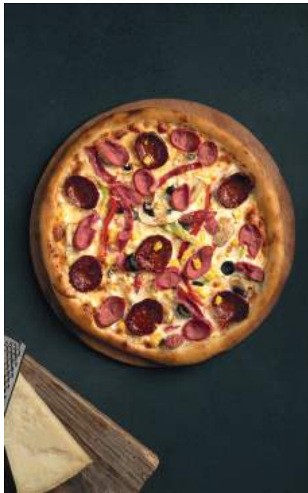
Quattro Formaggi Pizza