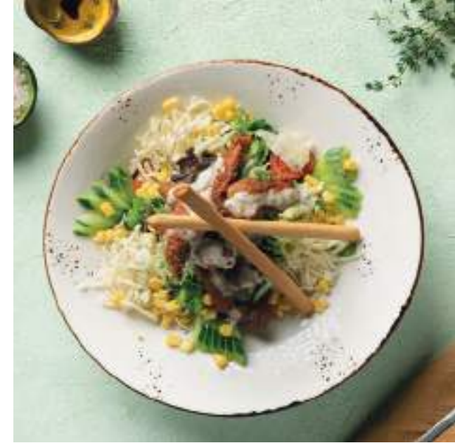
Cajun Chicken Salad