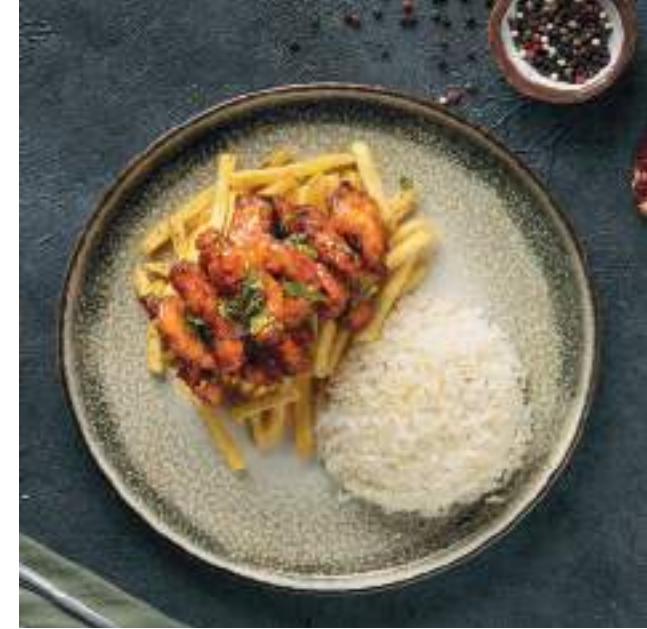
Sweet Chili Crispy Chicken