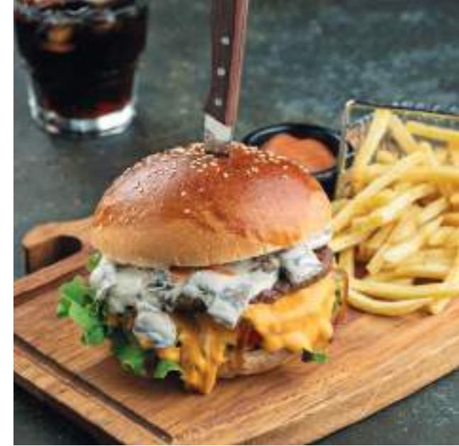
Truffle Mushroom Burger