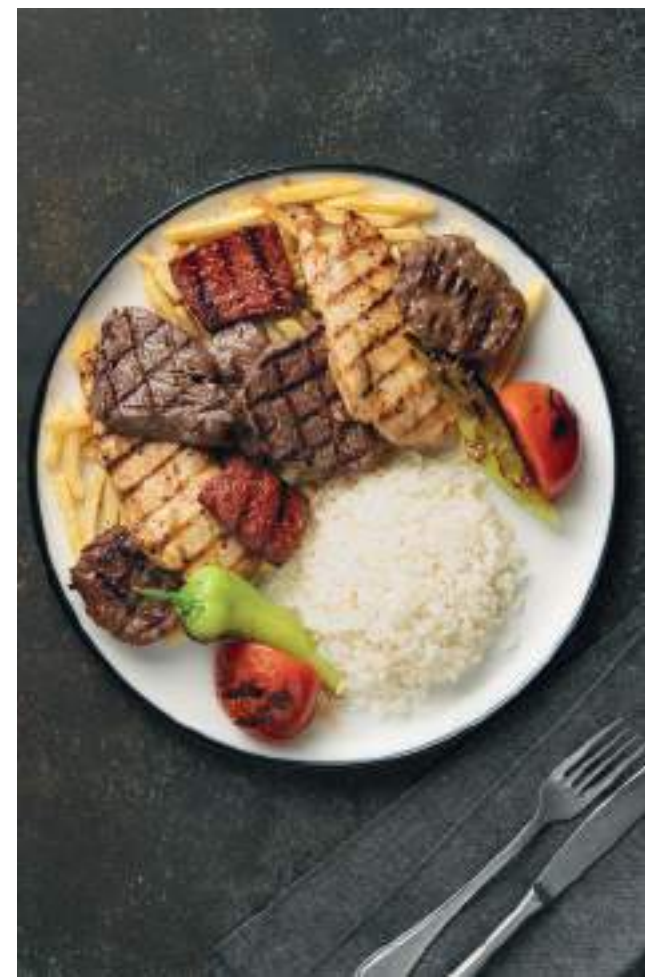
Bowl Grilled Chicken