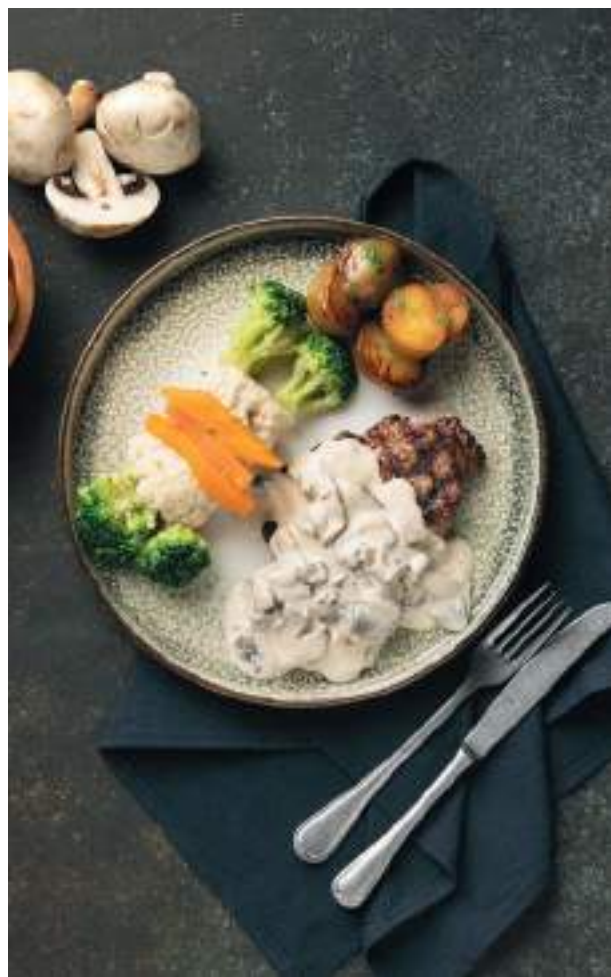
Mushroom Sauce Beef Tenderloin