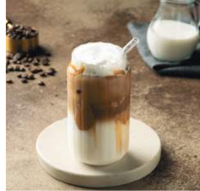
Iced Caramel Latte