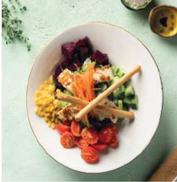
Halloumi Cheese Bowl Salad